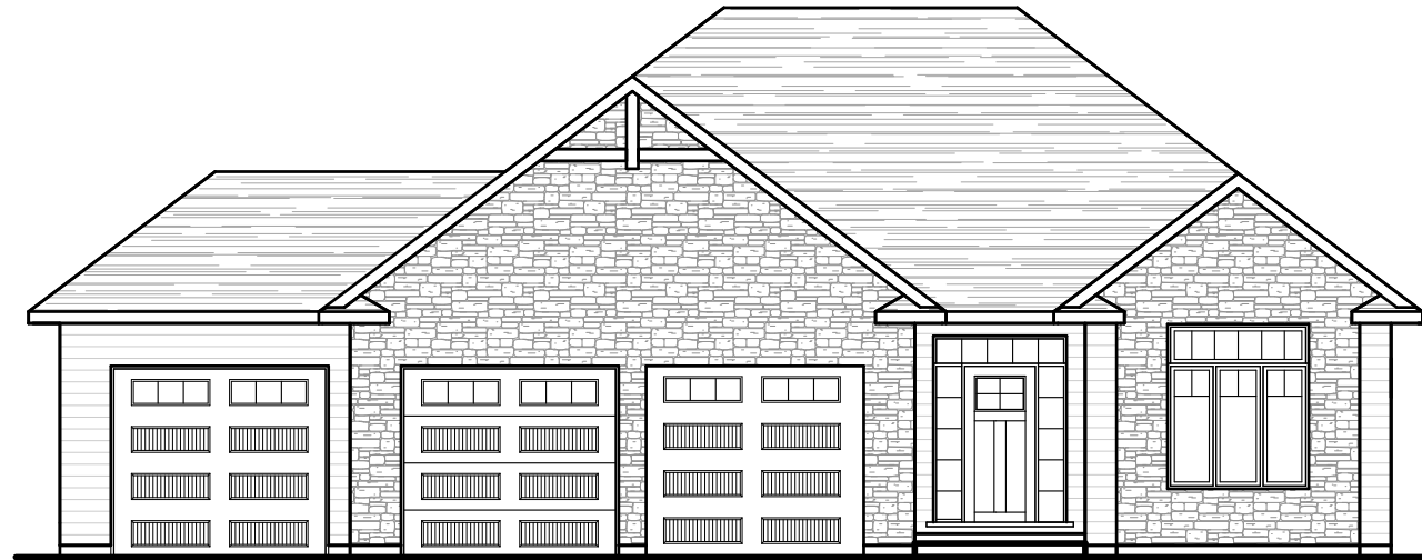
Optional Third Bay